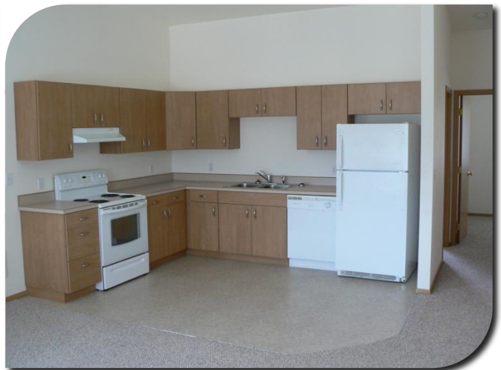
Kitchen inside the 2 Bedroom Unit