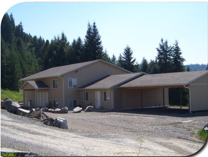
Carport of Western Building