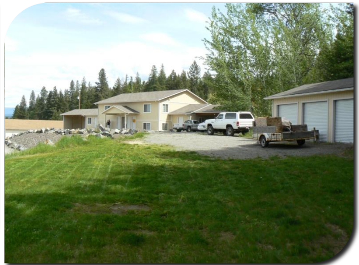
Looking at Shop Building