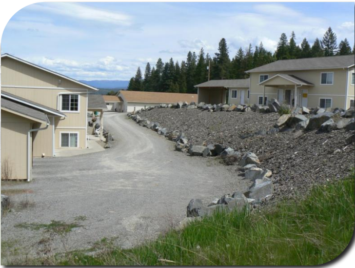
Both Buildings Looking North