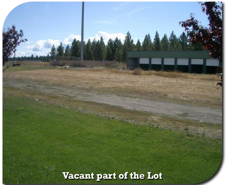
Vacant part of the Lot