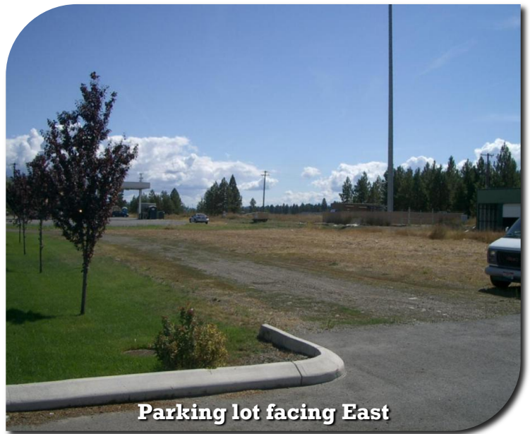
Parking lot facing East