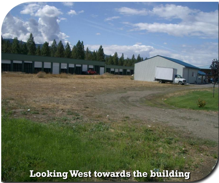
Looking West towards the building