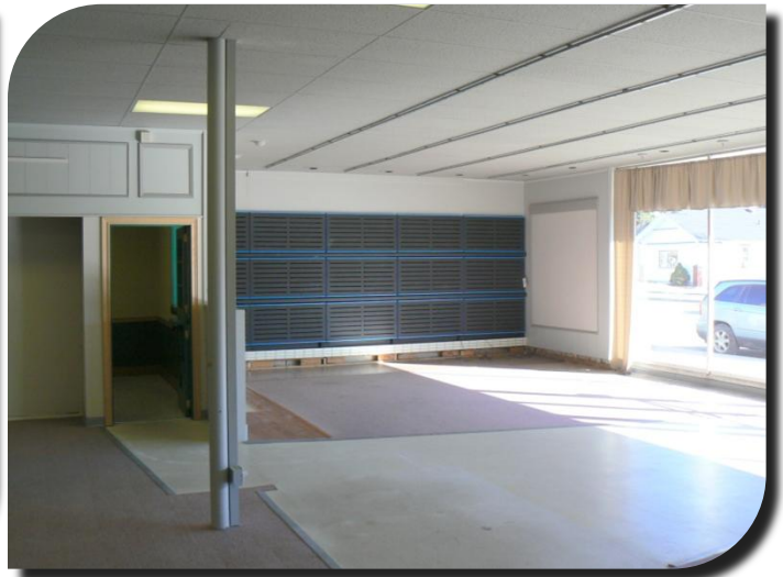
Front Window Area