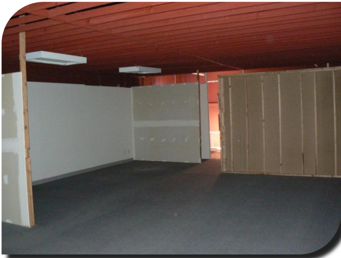
Storage Area / Office Area