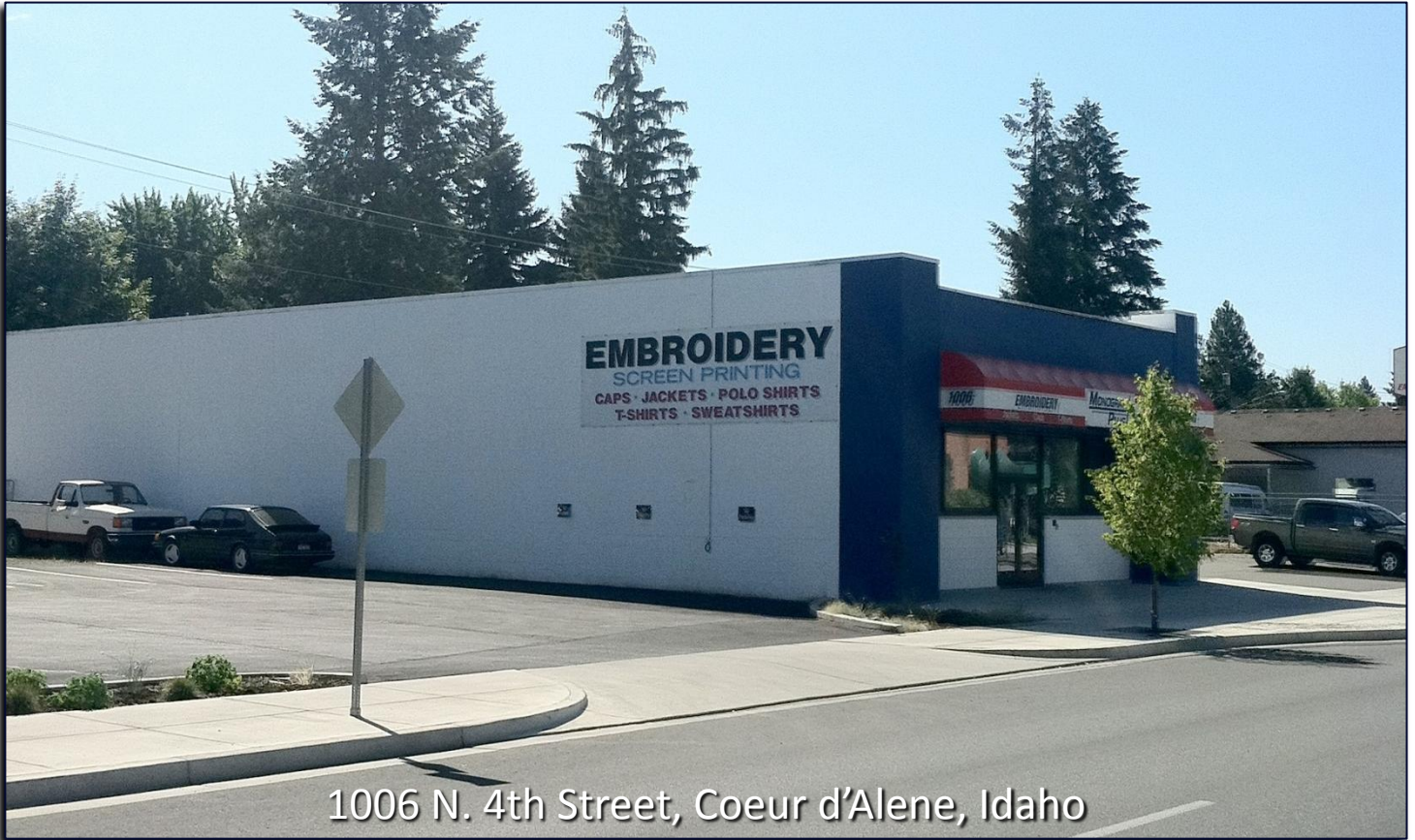
1006 N. 4th Street, Coeur d'Alene, Idaho